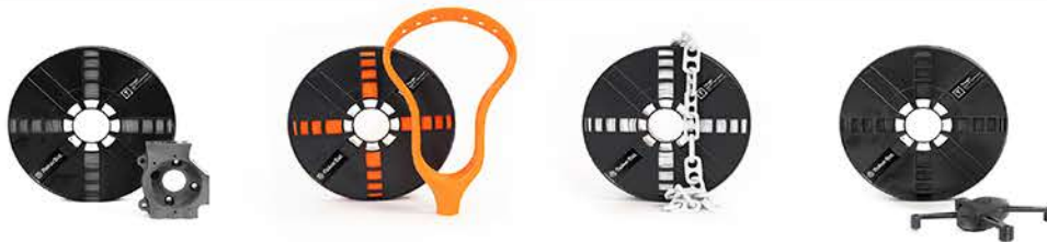
SLATE GREY MP06997